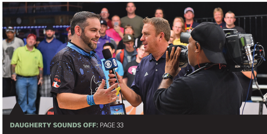
DAUGHERTY SOUNDS OFF: PAGE 33

Rash, Tackett tackle TV woes while Daugherty sounds off.