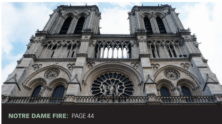
NOTRE DAME FIRE: PAGE 44