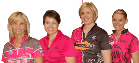
Bowlieve In A Cure