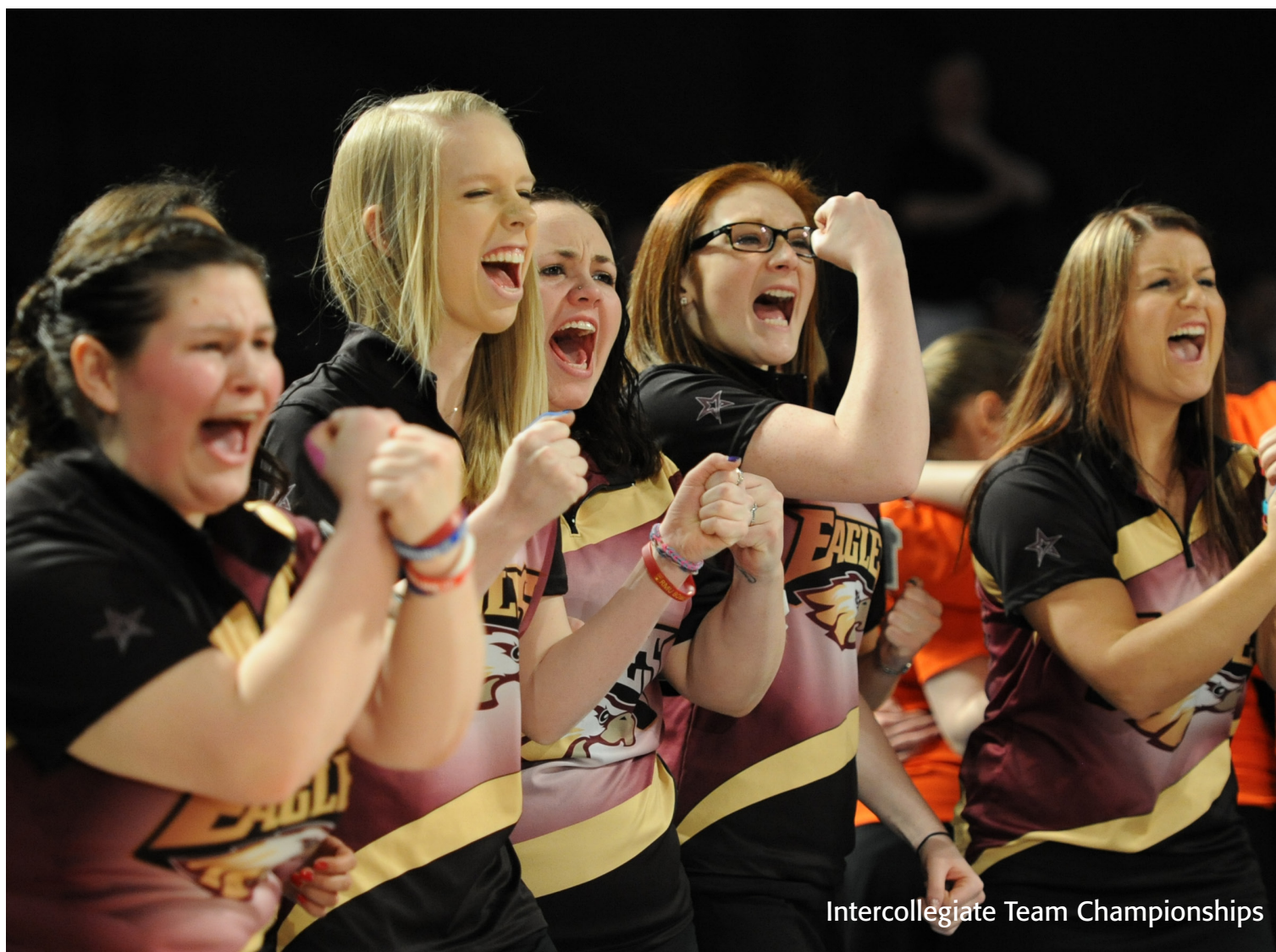
Intercollegiate Team Championships