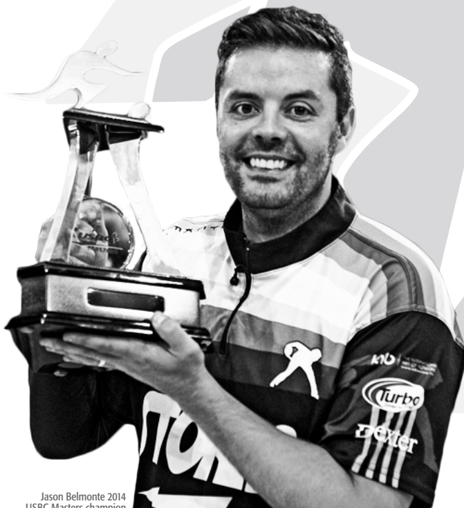
Jason Belmonte 2014 USBC Masters champion