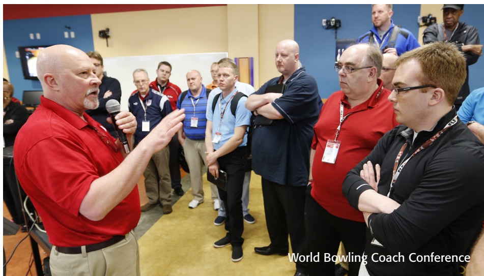
World Bowling Coach Conference

The Equipment Specifications and Certifications team has developed the Ball On Lane Tracking System (BOLTS), a new measurement system to replace the Computer Aided Tracking System (CATS). USBC is the leading source of technical information in our industry and the development of BOLTS served as a crucial step in aligning the abilities of our ball-throwing robot, E.A.R.L., with a more modern, advanced measurement system. Going forward, this system will be an integral part of the research process. USBC also modified the specifications on bowling ball gripping holes to simplify the specification. Under the new rule, any thumb hole not used for gripping purposes during the delivery would be classified as a balance hole.