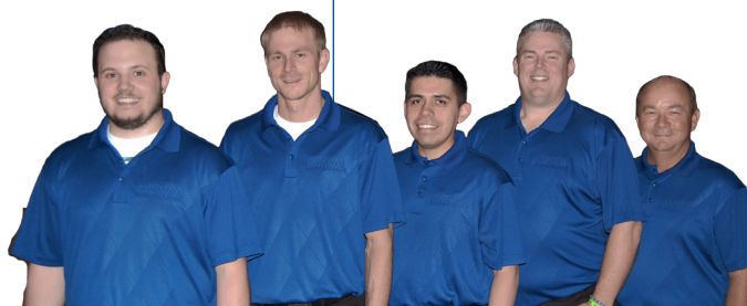
Artistic Expressions 1