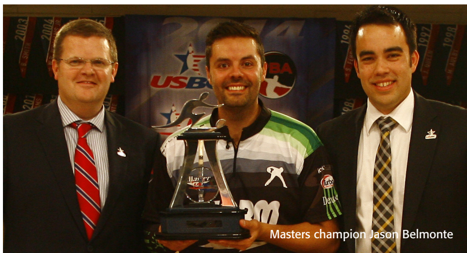
Masters champion Jason Belmonte

Our major tournaments continue to draw outstanding fields and provide exceptional opportunities for competitive bowlers. We saw Australia's Jason Belmonte make history