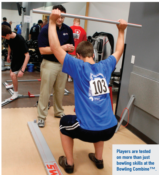
Players are tested on more than just bowling skills at the Bowling Combine™.

The boys' evaluations will take place Aug. 6-8, and the girls will run from Aug. 8-10. There is no charge for coaches to attend, but they must