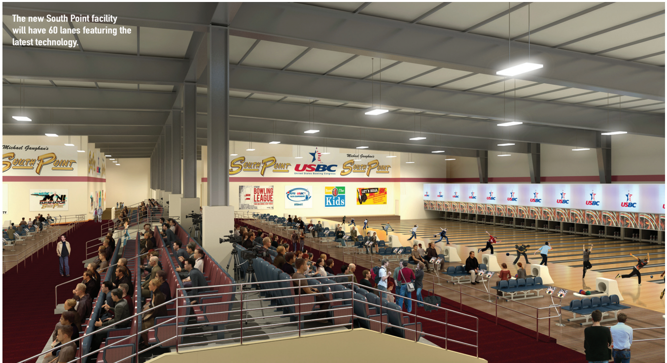
The new South Point facility will have 60 lanes featuring the latest technology.