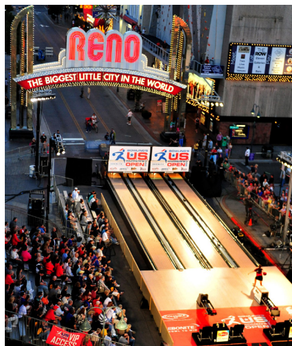
2012 Bowling's U.S. Women's Open