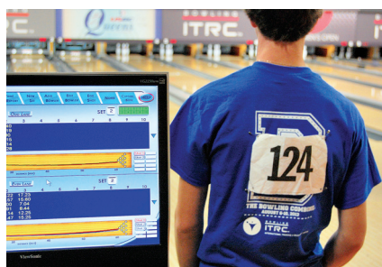
2013 Bowling Combine