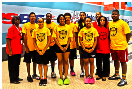
The National Bowling Association's Youth Weekend