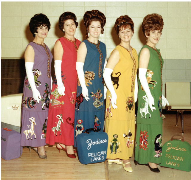
The Zodiacs have worn elaborate outfits since the late 1960s to earn the distinction as the World's Best-Dressed Bowling Team.

she doesn't hold the record for oldest participant at the Women's Championships.