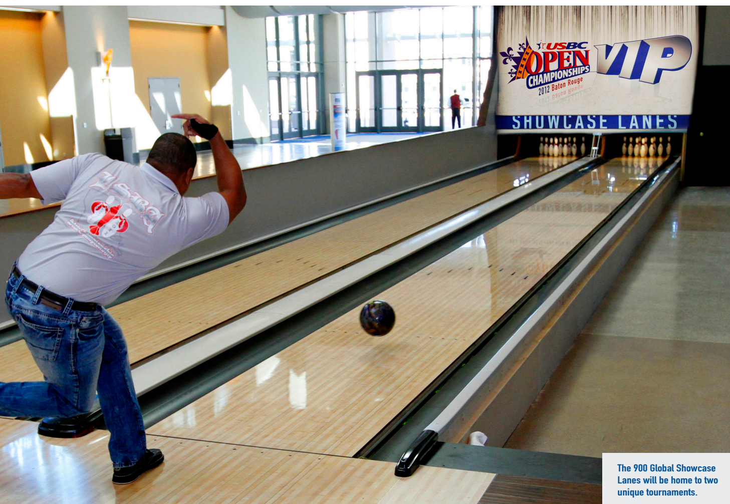
The 900 Global Showcase Lanes will be home to two unique tournaments.

When making plans for places to see in Reno when they are not bowling, tournament participants can check out BOWL.com/DiscoverReno. The video series explores some of Reno's popular destinations and best-kept secrets.